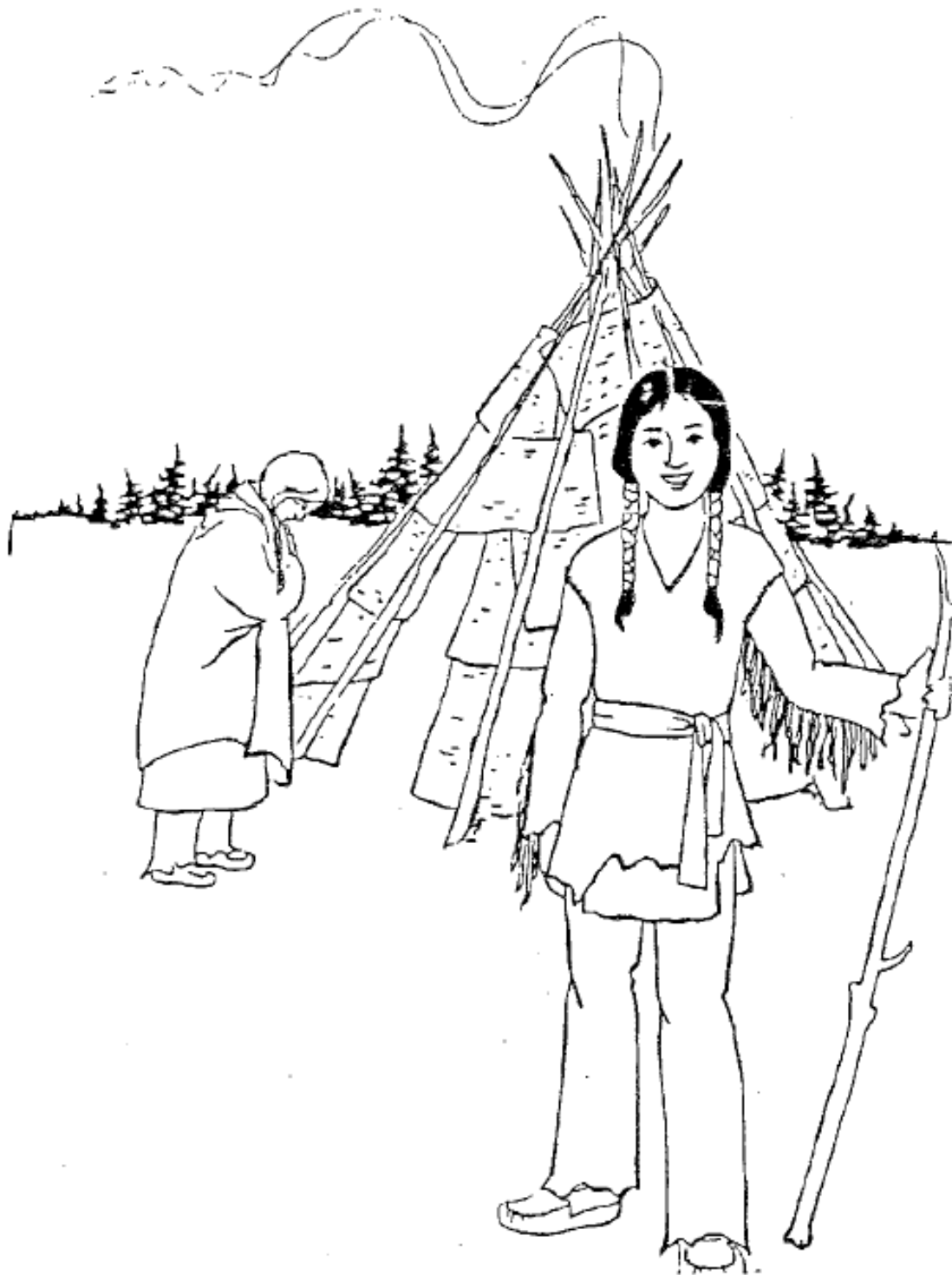
Mewinzha gwiwizens gii-nitaawigi, Nanaboozhoo izhinikaazo, ogookomisan ogii-nitaawigi'igoon noopoming.