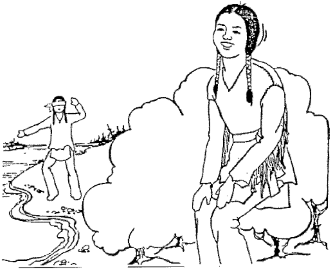
Gii-nitaa-miikindizi a'aw Nanaboozhoo, anooj igo gegoo gii-izhichige.